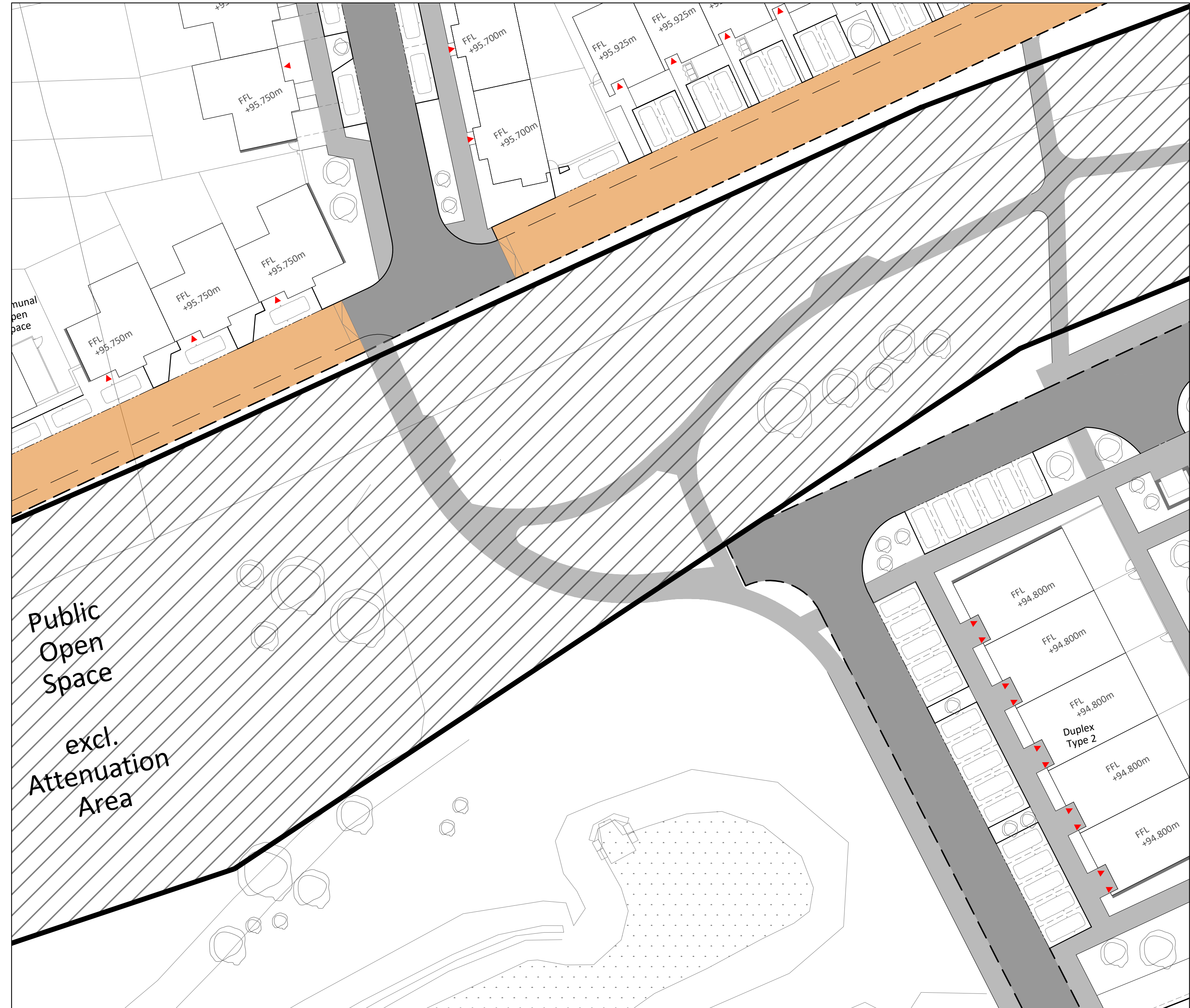
OPTION 2: FOOTPATHS ACROSS F1 ZONED LAND, ROAD REMOVED